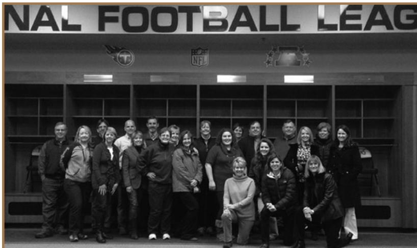
Below, Strategic planning kicked off in January with a retreat at LP Field. During a lunch break, participants got to tour the Titans locker room.