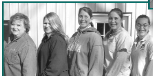
Below: All the behind-the-scenes smiling faces of Equine Medical Associates