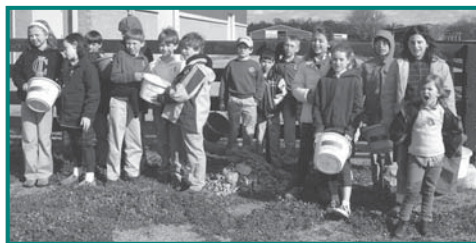
Currey Ingram students lend helping hands

In early April, Saddle Up! met some of the best rockhounds in town. A group of Kindergarten through 3rd grade students from Currey Ingram Academy joined us for a rock gathering extravaganza. This young group created a huge pile of rocks that came from the outdoor arena, the obstacle course, and the alleyway from the barn out to the Matthews Meadow pasture. Despite the brisk winds and the chilly temperatures, all of these children did a fabulous job of helping to improve the footing for our horses. Thank you very much.