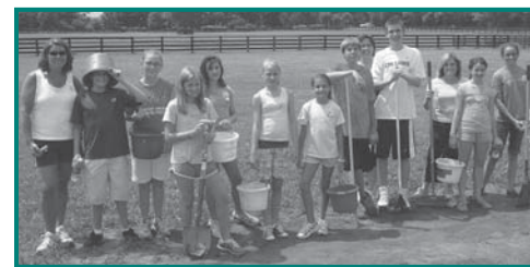
Harpeth Presbyterian Church youth paused briefly only for a photo opportunity

On a very hot day in June, the earth moved with a little help from the Harpeth Presbyterian Church youth group. An energetic combination of 6th, 7th, and 8th graders chose to spend their afternoon helping others and we are glad they chose us. A large amount of sand had washed out of our outdoor arena with thanks to the spring rains and it needed help getting back where it belonged. It was a tedious process, with people shoveling sand into buckets and the bucket brigade walking it back into the arena to dump it. It was not a summer vacation day at the beach, but with a little imagination you could almost hear the seagulls. Thank you, friends, for your efforts.