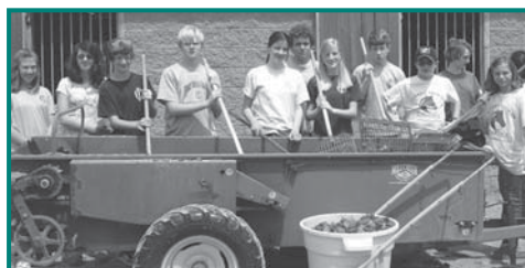
Currey Ingram teens not afraid to work hard

Later in April, Saddle Up! was lucky enough to have a group of students from Currey Ingram Academy help with some farm chores. Students, ages 13 and 14, showed up ready to do some dirty work. Initially they removed all the dirt and hair from all our herd's brushes and their brush boxes. They broke into two teams armed with muck buckets, shovels, and pitch forks and went to work removing all horse patty piles from the paddocks. Even though most teens would have requested to be finished after this job, they continued by removing all large rocks from the paddock areas. The teams tried to out do one another and see who could pick up the most manure. By the time they finished, the paddocks were clean and the manure spreader was ready to be dumped. Thank you for all the hard work.