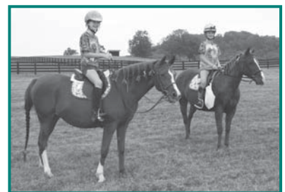
Open trails beckon all riders including these colorful teens

about the cover: Dumplin the 'un-official' spokes person-pony for this year's Country Ride 'N Roll invites one and all to the festivities.