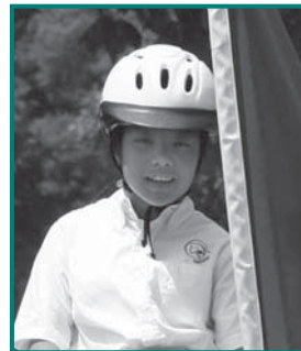
Confidence and pride beam from Peach’s face at last year’s flag ceremony at the Music Country Grand Prix.

Did you know... Saddle Up! is currently serving 98 regular program riders and 19 waitlist provisional riders of the 291 children still on the waiting list?