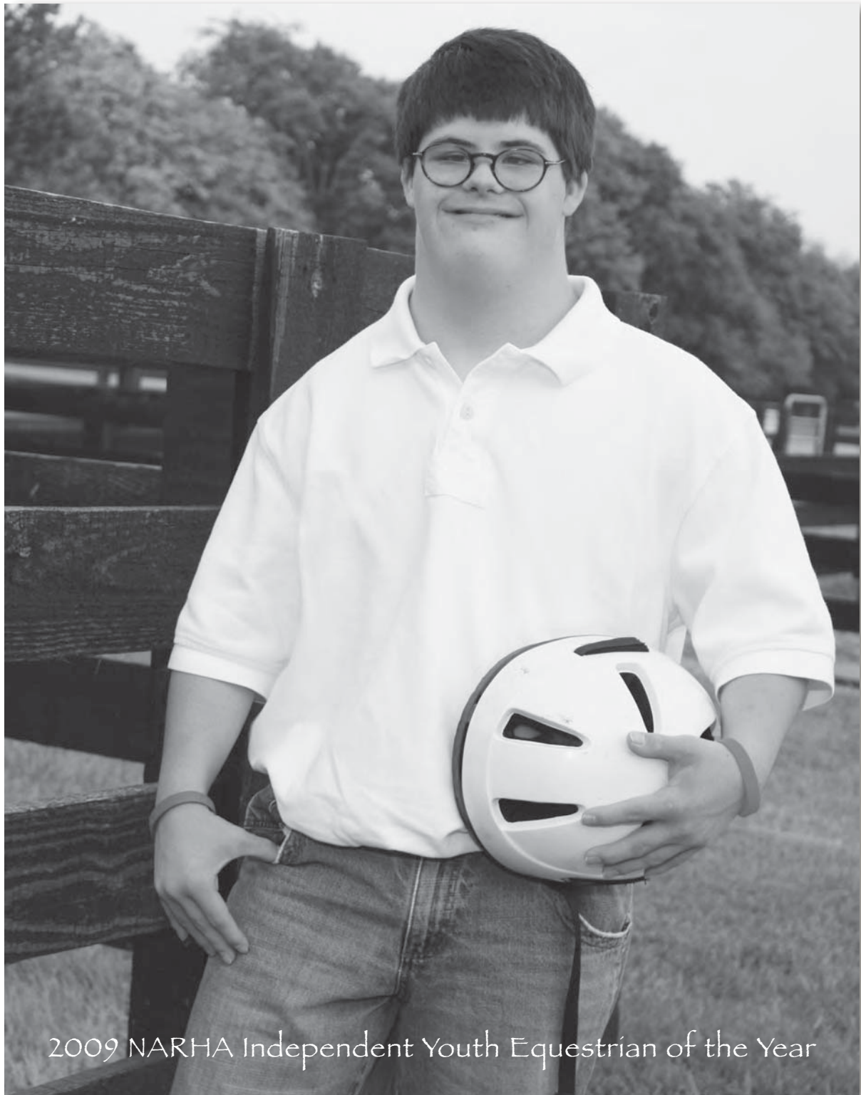
2009 NARHA Independent Youth Equestrian of the Year