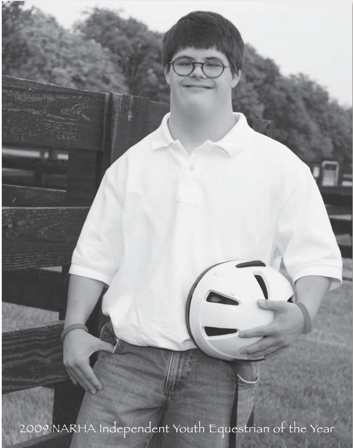
2009 NARHA Independent Youth Equestrian of the Year