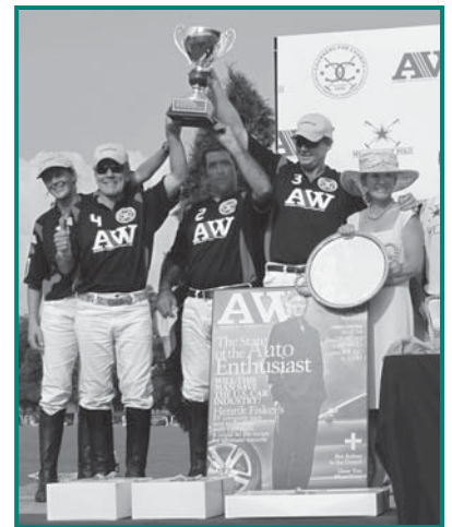
The AutoWeek Team proudly displays their 2009 Chukkers for Charity trophy.