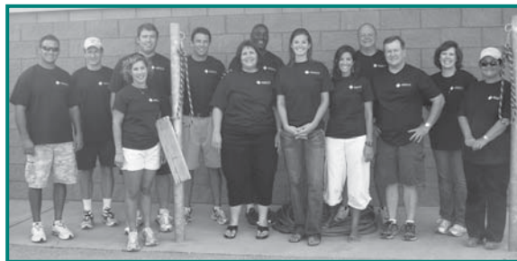
Merck Pharmaceuticals After working all day they presented Saddle Up! with a $500 cash donation.