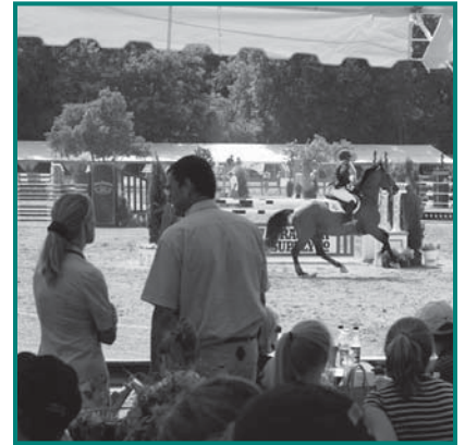
Spectators watch the excitement from the shade of the patrons' tent at the Music Country Grand Prix.

Patrons' Dinner Buffet: 6 p.m. (by Nero's Grill)