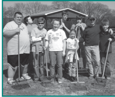
Bethlehem United Methodist Youth Group