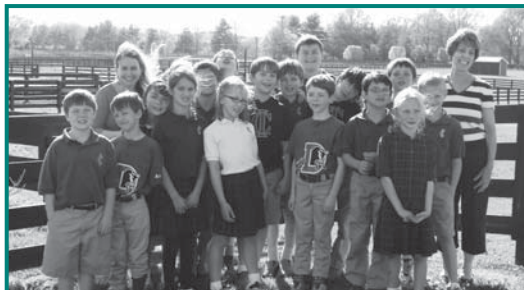
Currey Ingram Academy Elementary School Community Service Group