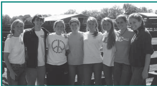
Ensworth High School