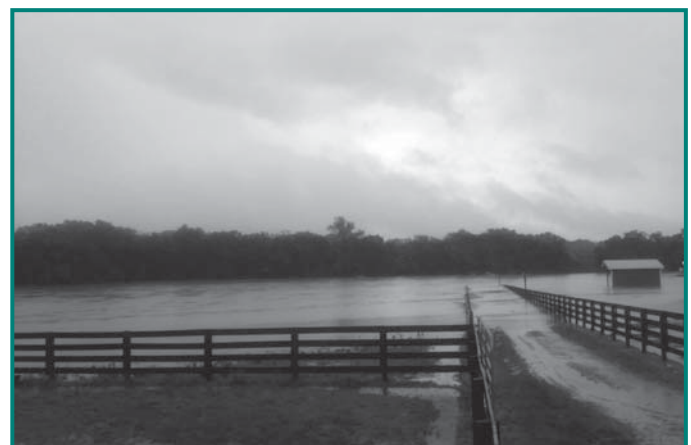
Air 4 Live flies over Saddle Up! to reveal extensive flooding from the Harpeth River, which runs at the back of our property (left). Water came dangerously close to reaching our main facilities. (right)